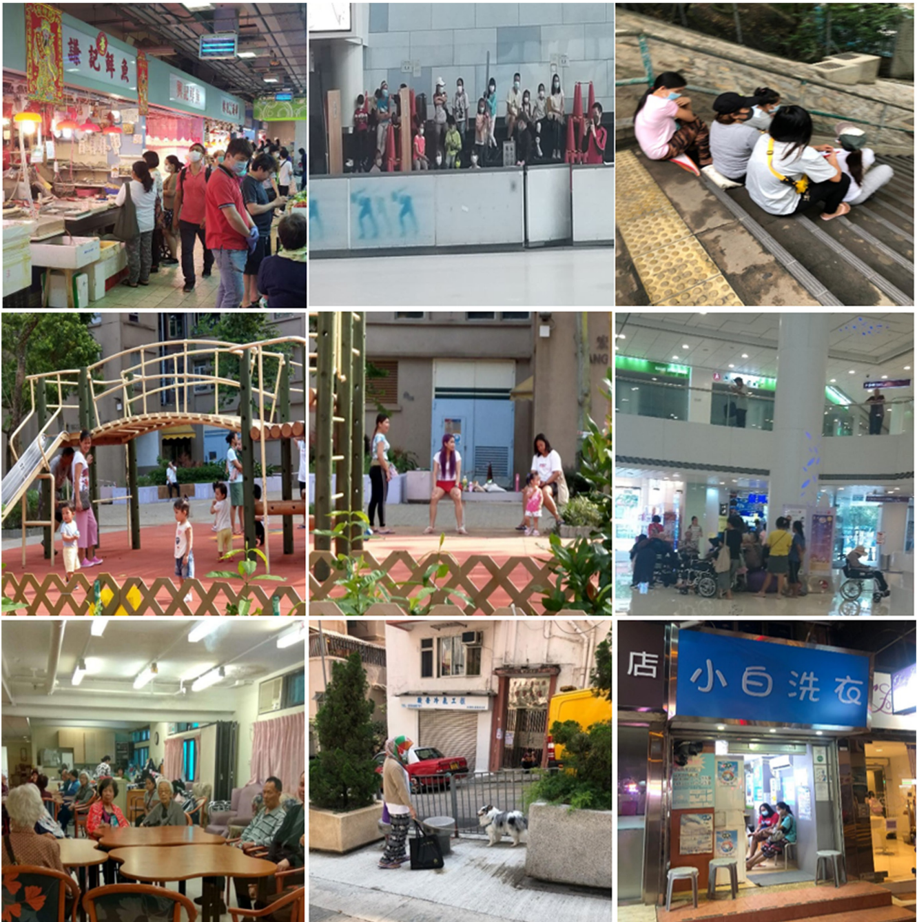
FIGURE 2 (Top-left) Some migrant domestic workers (in front of the fish stall) shopping for groceries in a wet market at about 10:00 AM on an ordinary workday. Source: Author. (Top-middle) Some migrant domestic workers (standing in the grandstand) accompanying children to ice-skating classes at about 3:00 PM on an ordinary workday (the children are not shown in this picture; the white surface is the ice-skating rink). Source: Author. (Top-right) A few migrant domestic workers waiting next to a secondary school entrance to pick up children from school at about 12:30 PM on an ordinary workday. Source: Author. (Middle-left and middle) Children of different ages, along with their migrant caretakers, gather in the playground at 5:00 PM on an ordinary workday. The playground is materially furnished (e.g., with shock-absorbing cushion on the ground, an all-age-welcome climbing rack, and benches, etc.) and well-maintained, which enables both the children and their caregiving workers to enjoy the playground and mingling time. Source: Author. (Middle-right) A group of elderly people, together with the migrant caretakers who take care of them, in a shopping mall at about 3:00 PM on an ordinary workday. The air-conditioned space provides a comfortable setting for informal gatherings among the elderly, who can stay away from the humid and hot weather during summertime. Source: Author. (Bottom-left) The elderly and the domestic workers accompanying them (sitting at the back) are drawn together in an elderly day-care centre every day. Source: Courtesy of the participants. (Bottom-middle) A migrant domestic worker performing dog-walking duty at about 11:00 AM on an ordinary workday. Source: Author. (Bottom-right) Two migrant domestic workers doing the laundry at a self-service laundromat at about 9:00 PM on an ordinary workday. Source: Author.